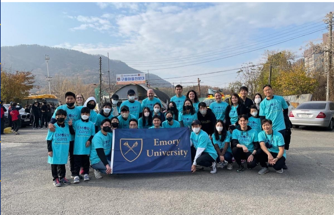
A group of Emory staff and alumni volunteered at Emory Cares International Day of Service in Seoul, South Korea in November. See Emory-South Korea engagement story for more details.

The Office of Global Strategy and Initiatives (GSI) is dedicated to the support, promotion, and expansion of Emory's engagement worldwide through implementing creative global programs, fostering cross-unit collaboration, and championing a culturally vibrant and diverse campus. To learn more about Emory in the world, visit global.emory.edu and subscribe to the GSI newsletter. Send all newsletter submission requests to global@emory.edu .